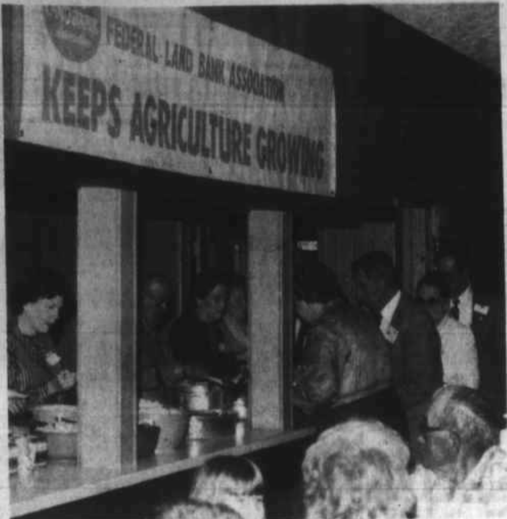
Area Land Bank members and guests enjoyed a catered barbecue meal at the recent stockholders meeting.

Area Land Bank members and guests enjoyed a catered barbecue meal at the recent stockholders meeting. The Federal Land Bank of Texas, the largest agricultural lender in the state, released its 1983 annual report during the meeting held in Austin, Texas. The report shows a 4 percent increase in loan volume for 1983, and a 10 percent increase in bond sales. The bank's earnings were up 10 percent, and its assets grew by $1.5 billion. The bank's loan portfolio is diversified, with a heavy concentration in agricultural lending. The bank's services include originating and servicing loans, as well as providing financial counseling to farmers and ranchers. The bank's commitment to the agricultural community is reflected in its low-cost financing programs and its efforts to improve the financial health of its borrowers.